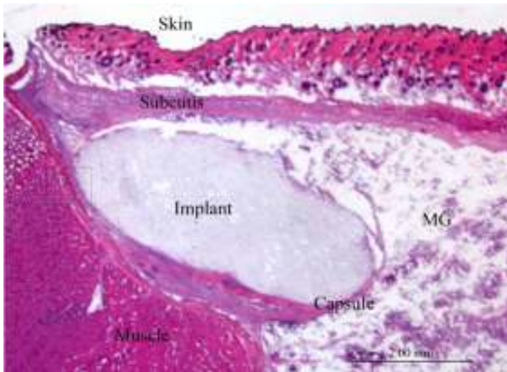
Hydrogel implant injected in rat subcutaneous tissue after 12 weeks implantation.

CPG scientists have developed a formulation of injectable hydrogel that can be used to reinforce human tissue, acting as a bulking agent. CPG hydrogels use a well-recognized biocompatible synthetic polymer, polyvinyl alcohol (PVA) that can be physically crosslinked after injection. Alternate tissue bulking materials are particle-based or are chemically crosslinked. These techniques pose potential health risks as chemical by-products can cause cell necrosis and particles can migrate. CPG hydrogels offer a safe tissue bulking agent that can be formulated for specific tissue applications.