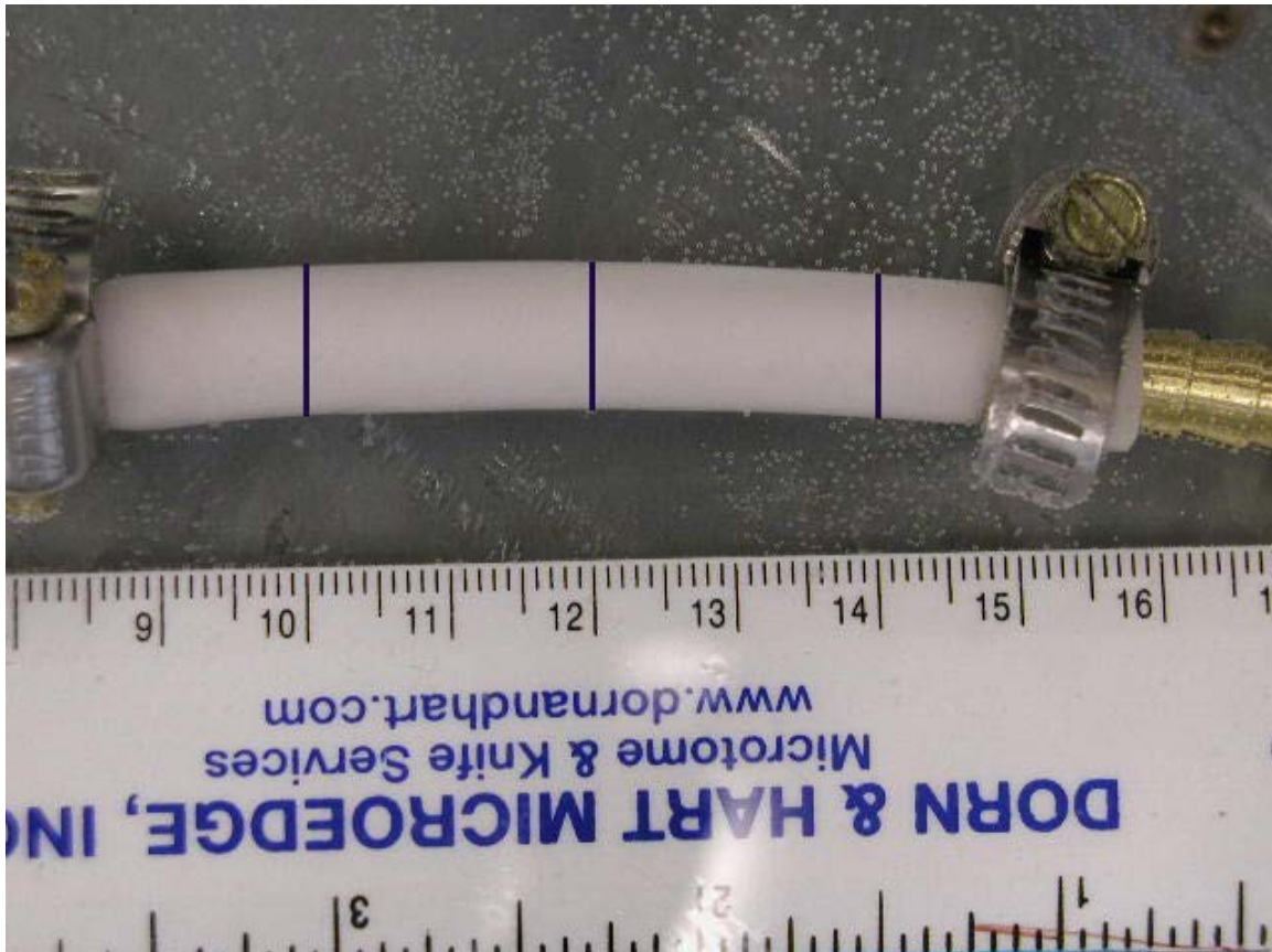
Figure 1: Hydrogel expansion at an internal pressure of 78 mm Hg. Vertical lines indicate the diameter measurement locations. 78 mm Hg.